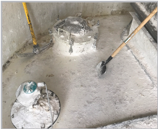
Pickaxes were used to remove sugar.