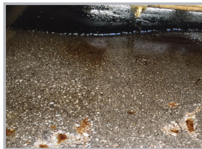
The thick syrup next to a portion that had been cleaned.