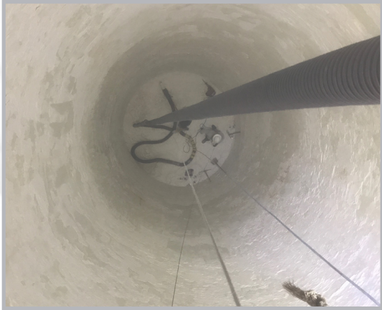
Six-inch field tile and picks were used to clean the two silos.

Lastly, Seneca removed 300,000 pounds of sugar from the two 120-foot indoor and outdoor silos using pickaxes and air movers.