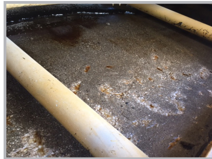
The concrete after the syrup had been chipped away.