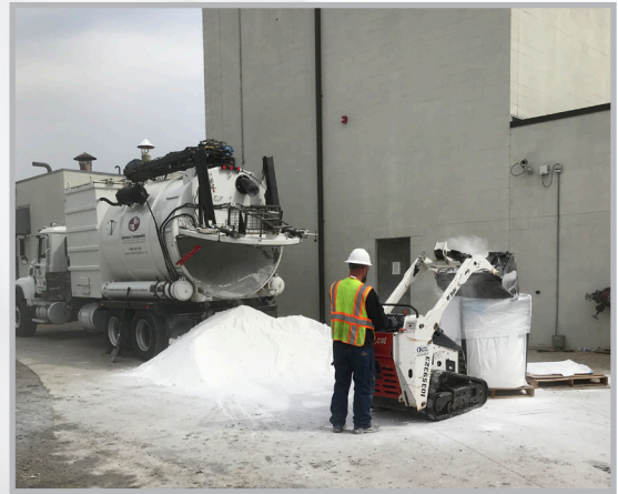
Seneca offloaded the sugar from the air mover truck into super sacs.

It was a challenge to clean and remove the mass quantity of material, but Seneca completed the project successfully, leaving the customer satisfied.