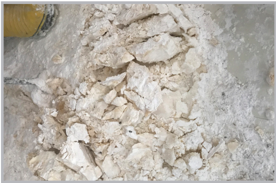
Two silos, containing 300,000 pounds of sugar, needed emptied.

In the spring of 2018, Seneca Companies Waste Solutions Services was hired to clean a candy factory in western Iowa that went out of business. Seneca cleaned the facility's seven syrup tanks, removed large amounts of syrup from two containments and emptied two silos that were full of sugar.