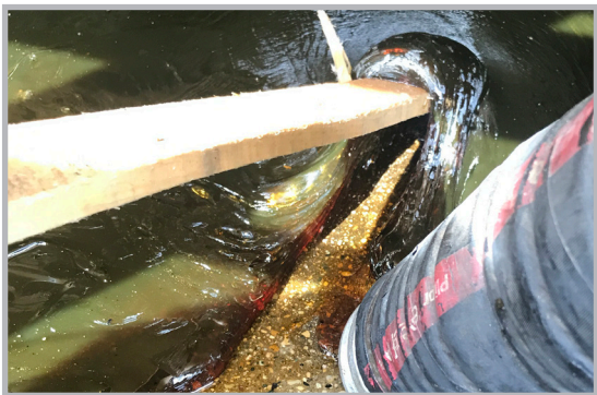
Seneca originally attempted to use a vac hose to clean the three to four inches of thick syrup, but dry ice ended up being used to freeze the substance.

Seneca's Waste Solutions personnel entered the empty syrup tanks via confined space entry through the manway. The seven tanks were cleaned using Seneca's hydroblasting truck at 5,000 psi and rinse waters were collected with Seneca's vacuum truck.