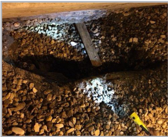
The sinkhole formed due to the broken line.

In February of 2018, Seneca's Waste Solution Services division was called to clean a storm drain at a food grade processing plant. Upon notification, Seneca crews showed up within 1.5 hours to jet the lines out. Originally, it was believed the line was simply plugged, but once crews began jetting the lines with Seneca's high-pressure jetting truck, they noticed a sinkhole being created from the broken line.