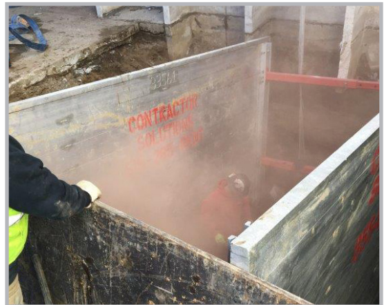
Shoring to work on pipe due to ground collapsing.

This problem was solved by bringing in a shoring box and placing it in the excavation hole for the safety of everyone working on-site. Seneca then utilized one of its frac tanks to hold the contaminated groundwater.